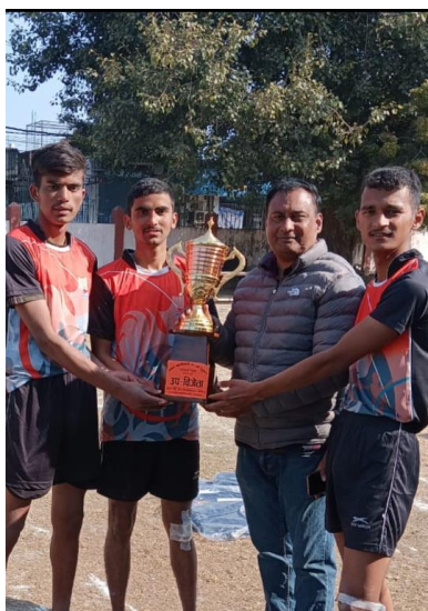
Kho-Kho(boys) Runner Up