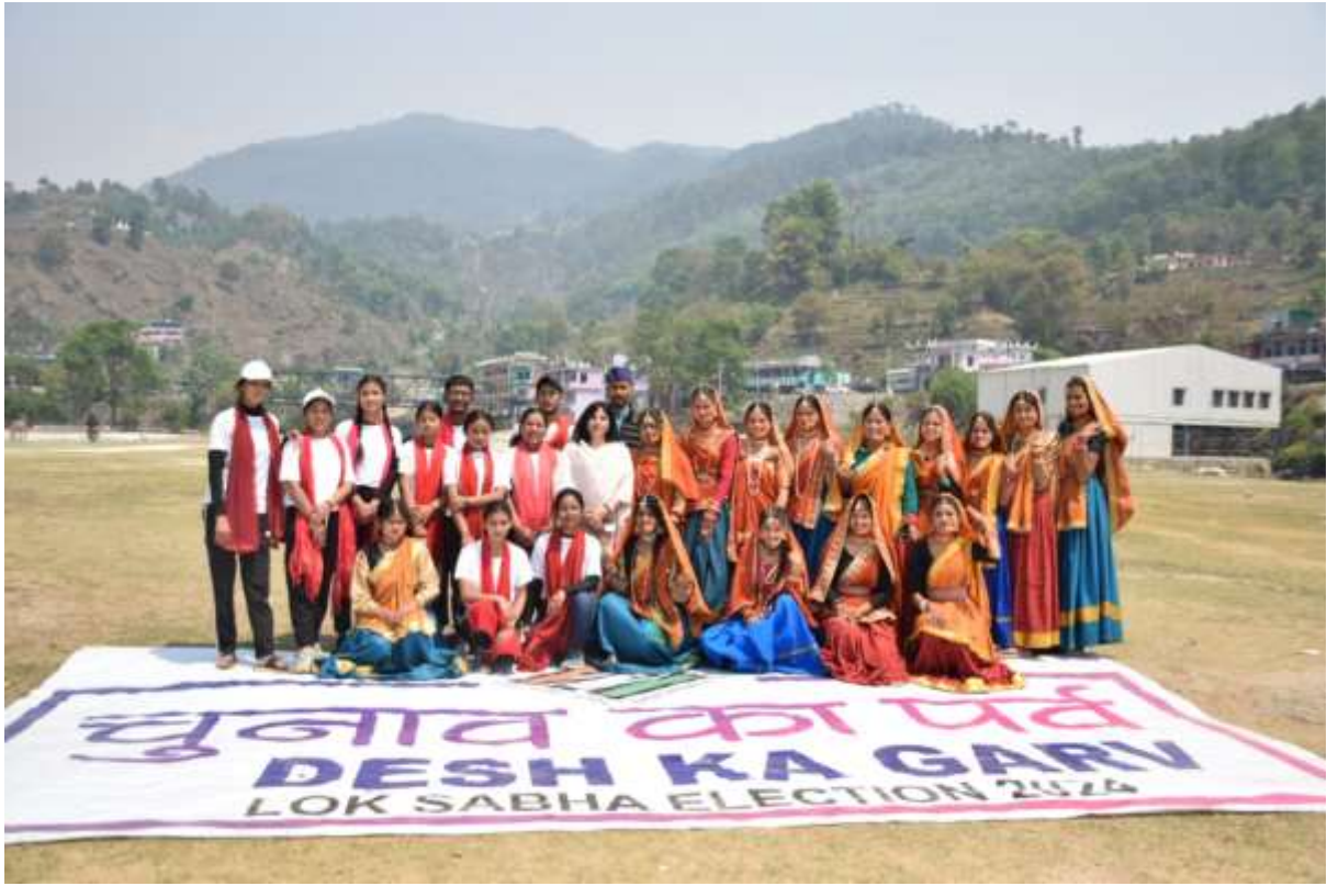
9- On 15 th April 2024 one massive voter awareness rally was initiated in which Collage students sloganeered regarding voter awareness process & gave brief details to village people.