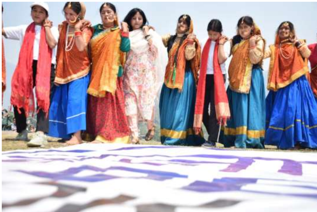
Folk dance & Skit

8- On 8 th April 2024, some of the students also participated in voter awareness program held at Kedaribagad Field Kapkote under the guidance of Nodal officer SVEEP, Bageshwar. In this program the students of the instituted presented a folk dance performance and skit on the theme “Chunav ka Parv, Desh ka Garv” (Elections: the biggest Festival and Pride of the Nation)