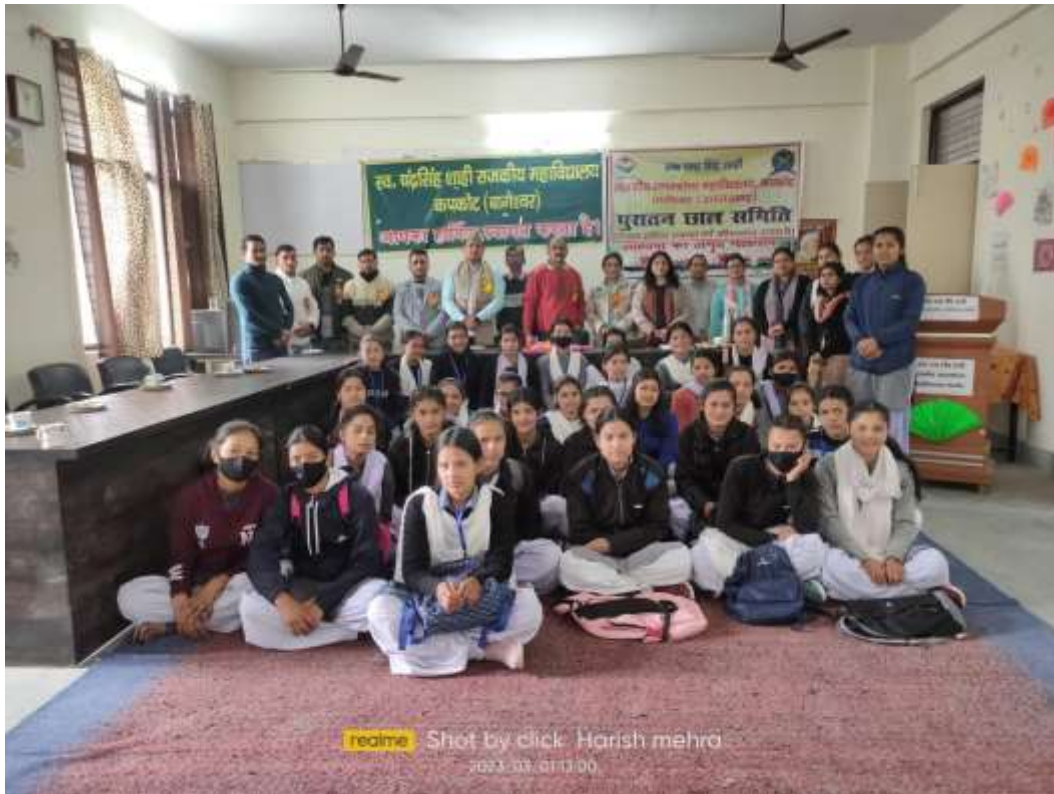
realme 2023-03-01 13:00