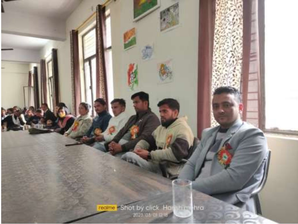
realme 2023-03-01 12:18